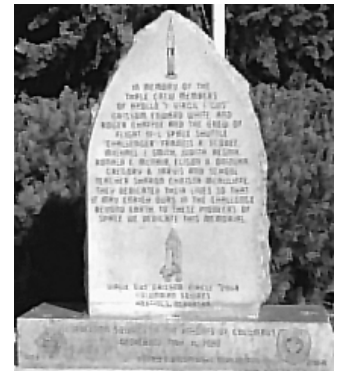
Marker Honoring Apollo I and Challenger crews

The heroes who fought and died to preserve the union, and those who have been called on by their nation since, have given us the right, and the opportunity to picnic and play freely. This year amid the hot dogs and softball, let us remember the price others have paid for our freedom.